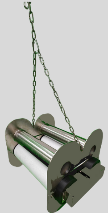
ORIENTED FOR COARSE BUBBLE